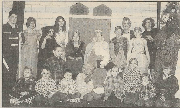
The cast of 'Sleeping Beauty' on stage.