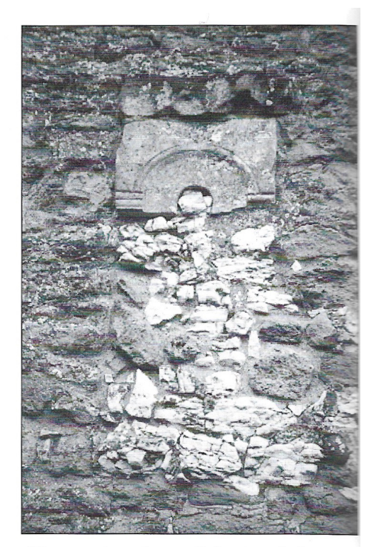
The remains of a small Saxon window on the north wall of St. Mary's Church.