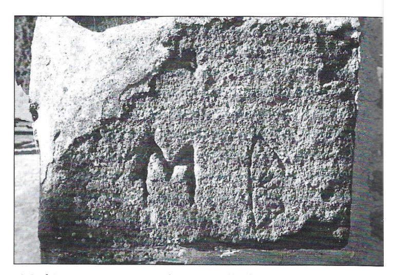
Markings on a quoin on the east wall of St. Adelwold's church porch. Could this be a masons marks, or is it just a piece of ancient graffiti? (Photo: the author, November 2000).